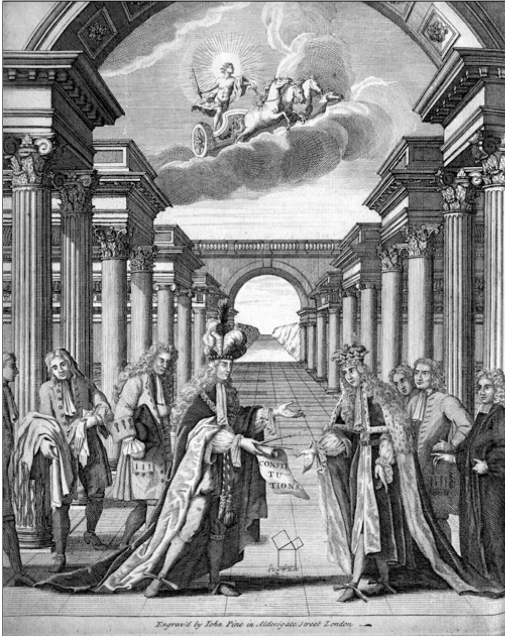
Frontispiece to James Anderson's Constitutions of Free Masonry Engraved by John Pine, 1772 or 1723