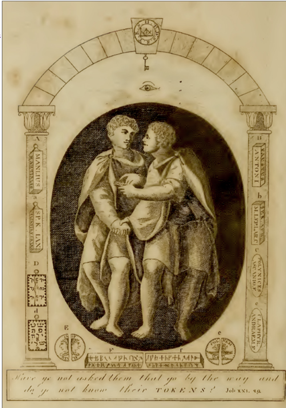
Frontispiece Discourses of Free Masonry